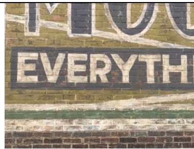
Mystery Location #6 is where: