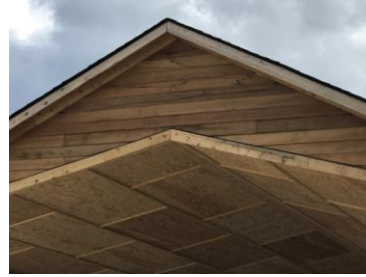
Mystery Location #2 is where: