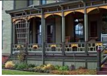
Mystery Location #3 is where: