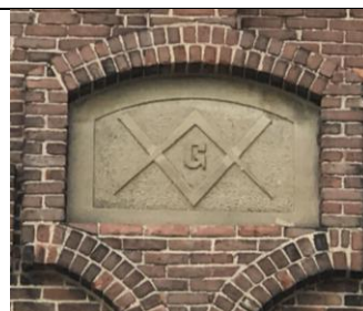
Mystery Location #10 is where: