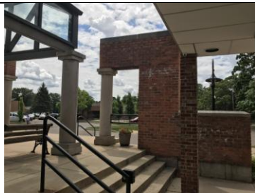
Mystery Location #7 is where: