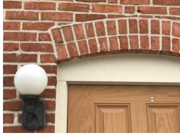
Mystery Location #1 is where: