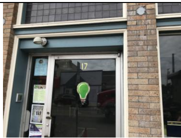
Mystery Location #5 is where: