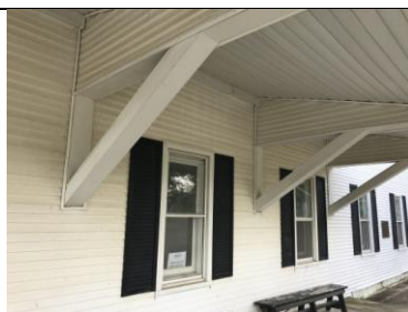
Mystery Location #9 is where: